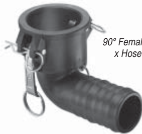
90° Female Coupler x Hose Shank