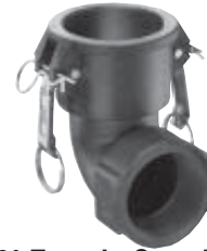
90° Female Coupler x Female NPT