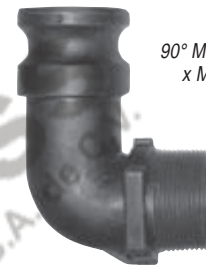
90° Male Adapter x Male NPT