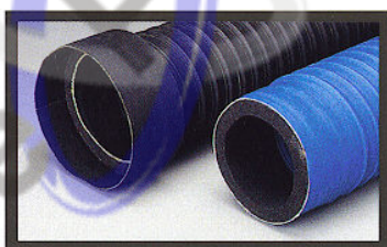
Enlarged or Reduced Cuffs 1" – 24" ID (see hose type)

Features: Heavier weight material for higher temperature abrasion applications