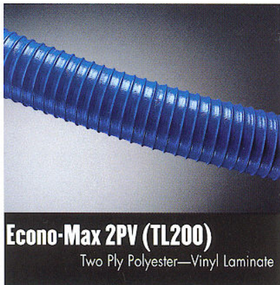
Econo-Max 2PV (TL200) Two Ply Polyester—Vinyl Laminate

sizes 1½" – 24" ID std. lengths 25 ft. colors blue or black temp. range -20° to 180° F (intermit. to 225° F) options Avail. as 2PVW with wearstrip. (3" – 24" ID) Non-std IDs and lengths made to order. Cuffed ends avail. Also available as 1PV (one ply) for lighter applications.