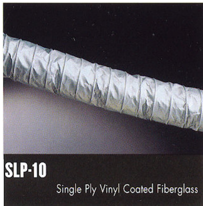
SLP-10 Single Ply Vinyl Coated Fiberglass

Features: Flame retardant to UL94V-O. Resistant to ozone, UV rays, mildew. Impervious to leakage from most oils, water, chemicals and grease. Very cost-effective product for dust and fumes.