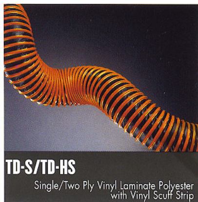
TD-S/TD-HS Single/Two Ply Vinyl Laminate Polyester with Vinyl Scuff Strip

Features: Fiberglass cover with flame retardant vinyl coating each side. Vinyl-coated spring steel wire helix permanently bonded to carcass. Flame retardant to UL94V-O. Excellent flexibility.