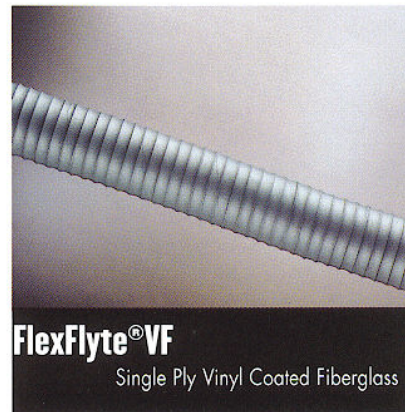
FlexFlyte® VF Single Ply Vinyl Coated Fiberglass

Features: Flame retardant vinyl coated woven fiberglass cover permanently bonded to a PVC-coated spring steel wire helix. Meets UL181 class flammability rating.